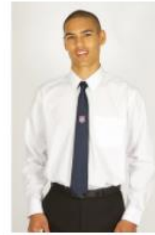
Pack of 2 Long Sleeve Polycotton Easycare White Shirts by Trutex