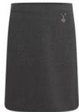
Grey Lycra Skirt with Heart Detail