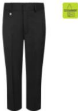
Boys Elastic Back Pull Up Grey School Trousers by Zeco