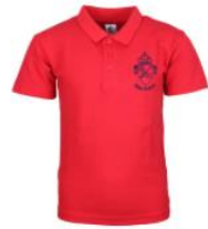
Hale Polo Shirt by Trutex