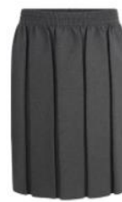
Grey Box Pleat Skirt