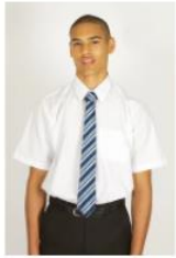
Pack of 2 Short Sleeve Polycotton Easycare White Shirts by Trutex