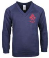
Hale V Neck Sweatshirt by Trutex